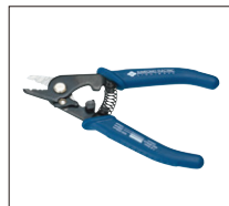
Jacket remover JR-M03