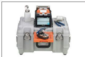
Carrying case with worktable CC-72