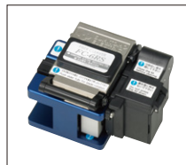
Table-top cleaver FC-6 / FC-6R series