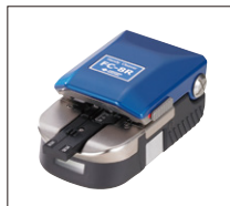
Handy cleaver FC-8R series